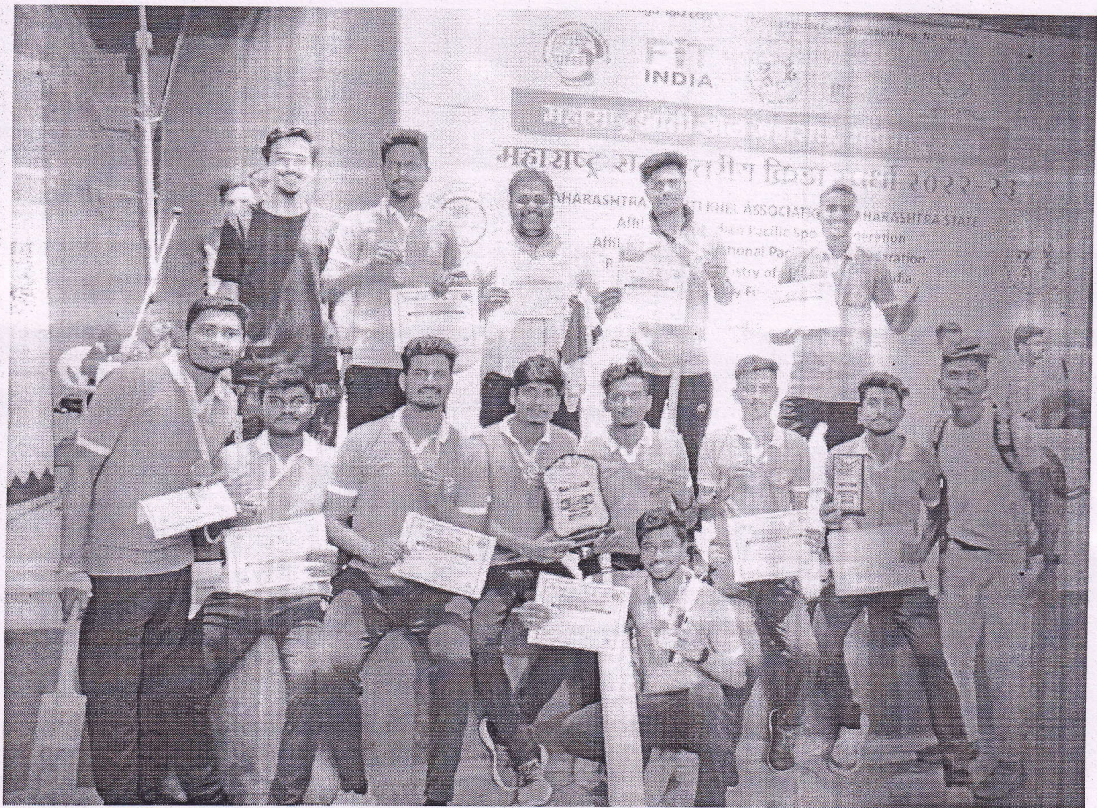
E copies of Awards and certificates 2022-23