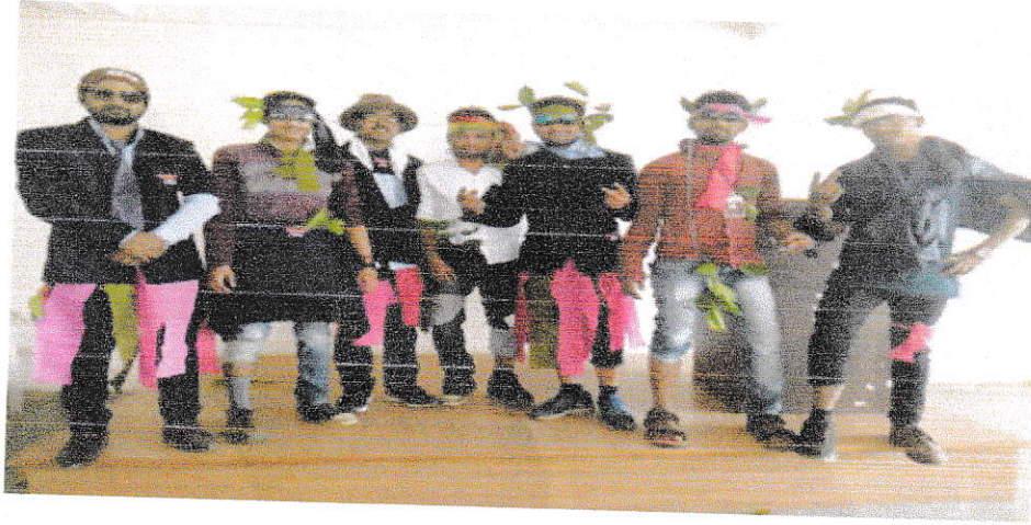
Mismatch day 2018