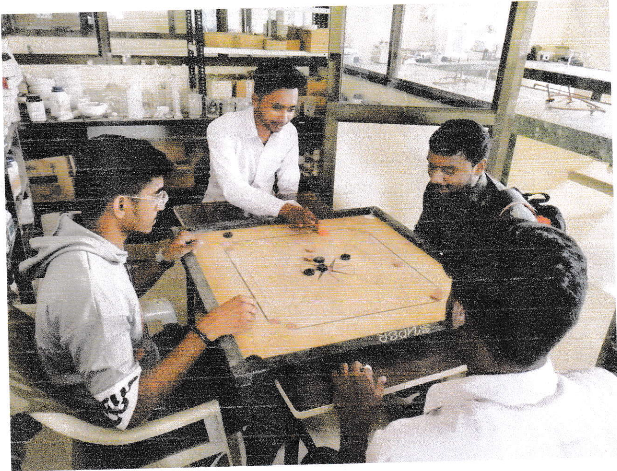
Indoor Game activities carom 14/12/2019